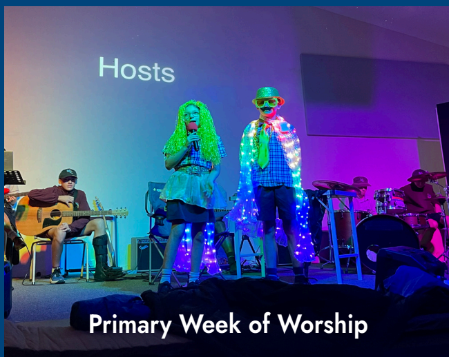
Primary Week of Worship